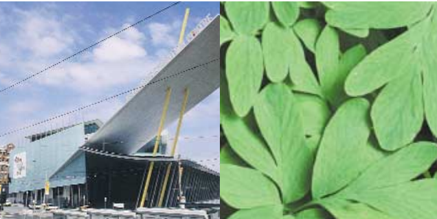
Left: Melbourne Exhibition Centre