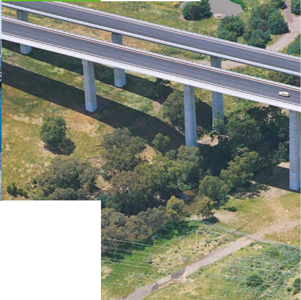
Above and front cover: Beacon Cove Marine works Right: EJ Whitten Bridge Far right: Bolte Bridge

The Ecoblend range of cements are specifically formulated to reduce the environmental impacts of cementitious binders used in concrete and stabilisation products. Ecoblend uses supplementary cements such as slag and flyash to ensure a significantly lower product life cycle impact; it provides the option of using a binder with significantly less material input, energy input and emission output. A very low embodied energy material can be created.